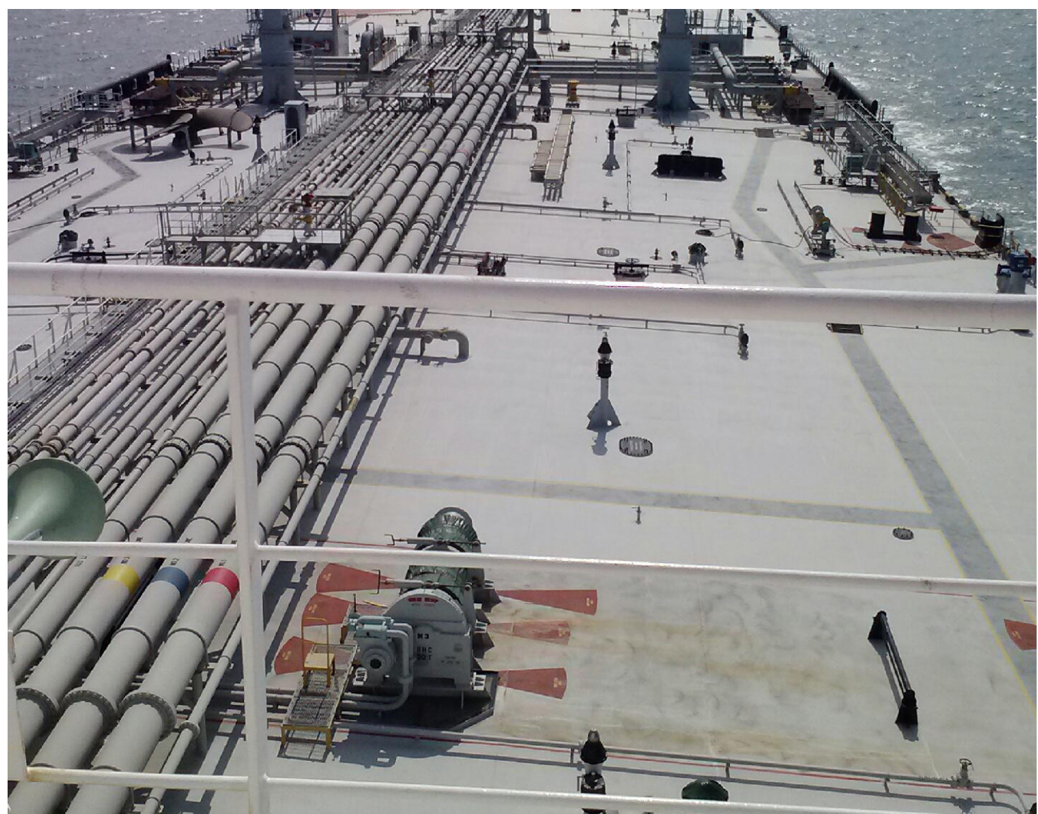
Tanker Orpheas (900 feet long with a 55 foot draft) with a load of No. 6 fuel oil from Africa making way in Long Island Sound to Riverhead platforms.

WHAT HAS THE ATTENTION OF THE MARITIME SECTOR IN D.C.? we await the House bill that may be unveiled in July. What it will have Depends on who you are. Here's my abbreviated take on the question. in channel projects will be less important to most ports than will policy If you are a port there's the continuing watch-for-WRDA. The Senate changes having to do with the Harbor Maintenance Trust Fund. If you are passed its version of a Corps of Engineers policy and projects bill; now in the U.S.-flag sector the overwhelming question is whether Congress